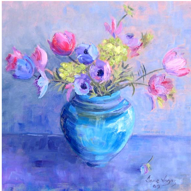
Wild Anemones in a Vase 30 x 30 cm oil on canvas 300 euros