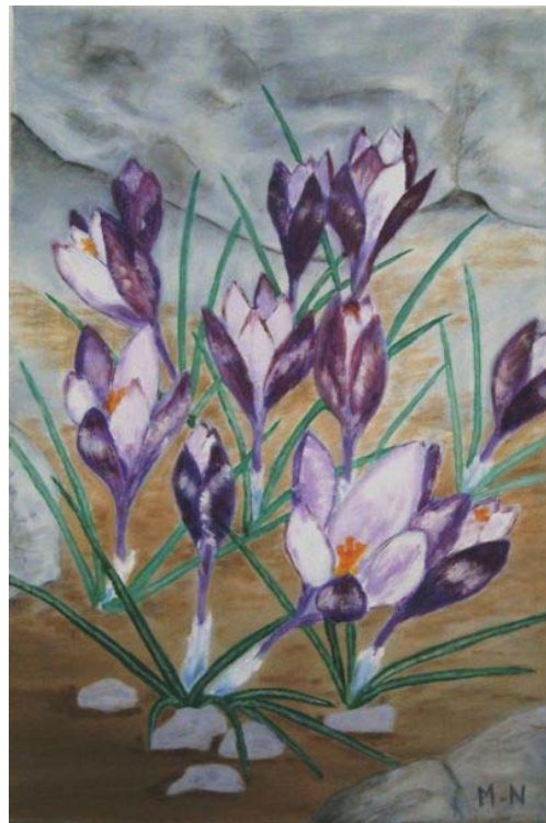
Wild Crocuses sieberi