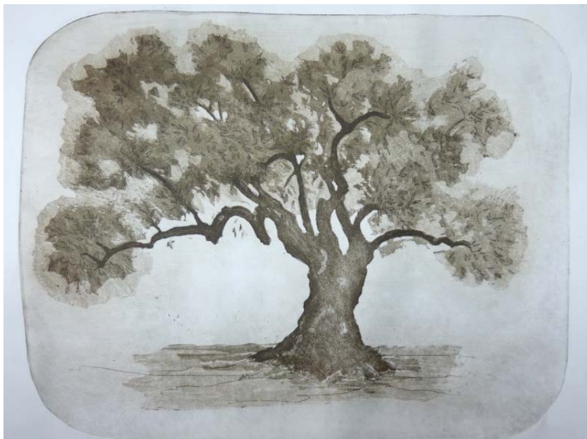
Old Olive 39 x 35 cm (framed) Framed €100 Etching on Fabriano Rosapina paper (1/50) Unframed €80