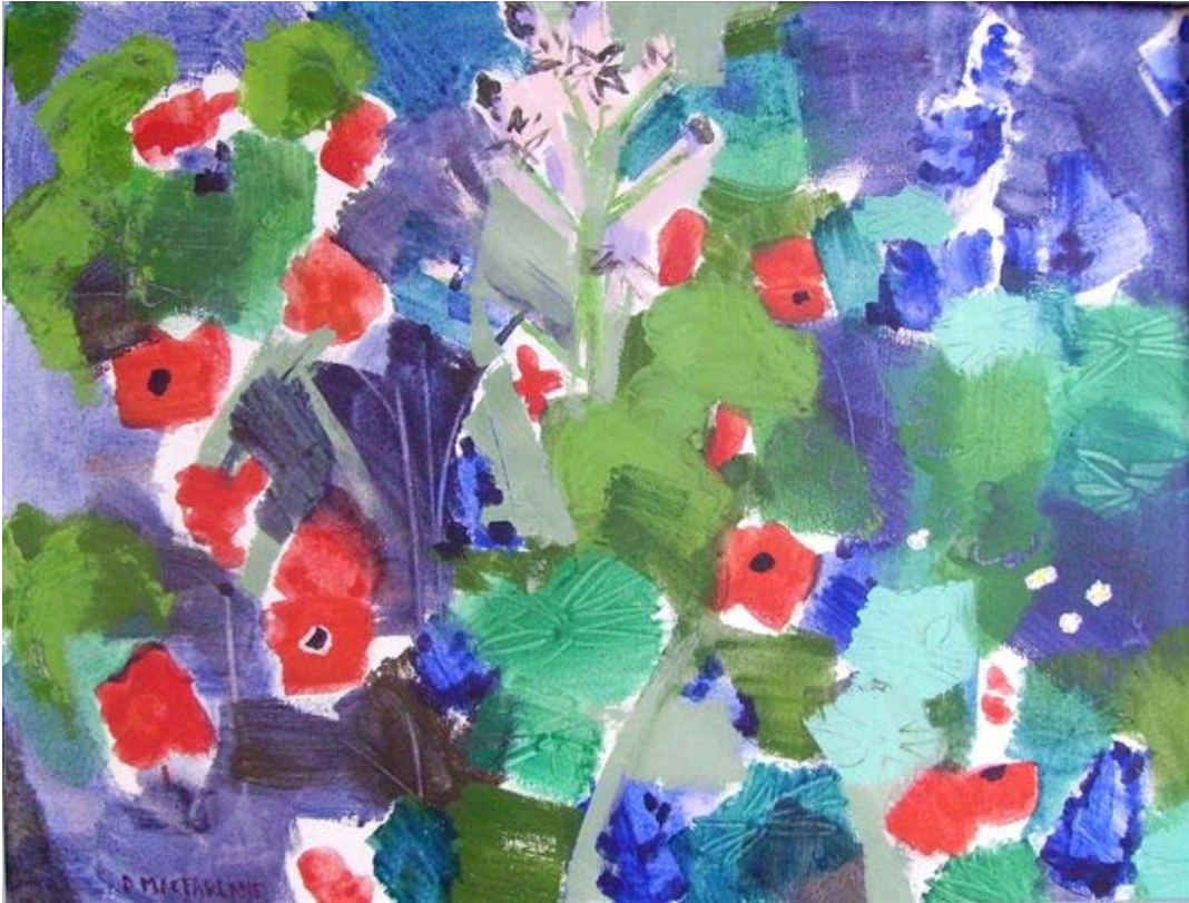
Lupin, Anemones and Asphodels