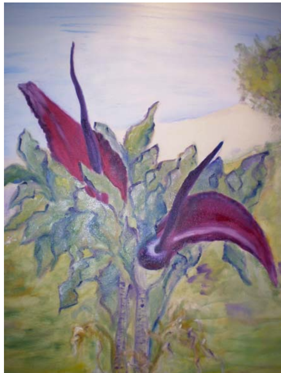
Dracunculus vulgaris 50 x 60 cm Oil on canvas €200