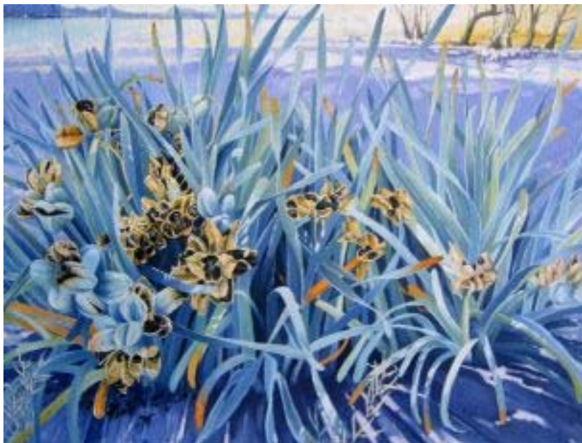
Sea Lilies – oil on canvas – 60 x 80 m - €380