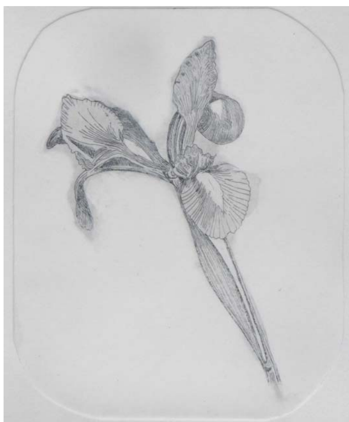
Iris 26 x 31 cm (framed) Framed €60 Etching (1/50) Unframed €40