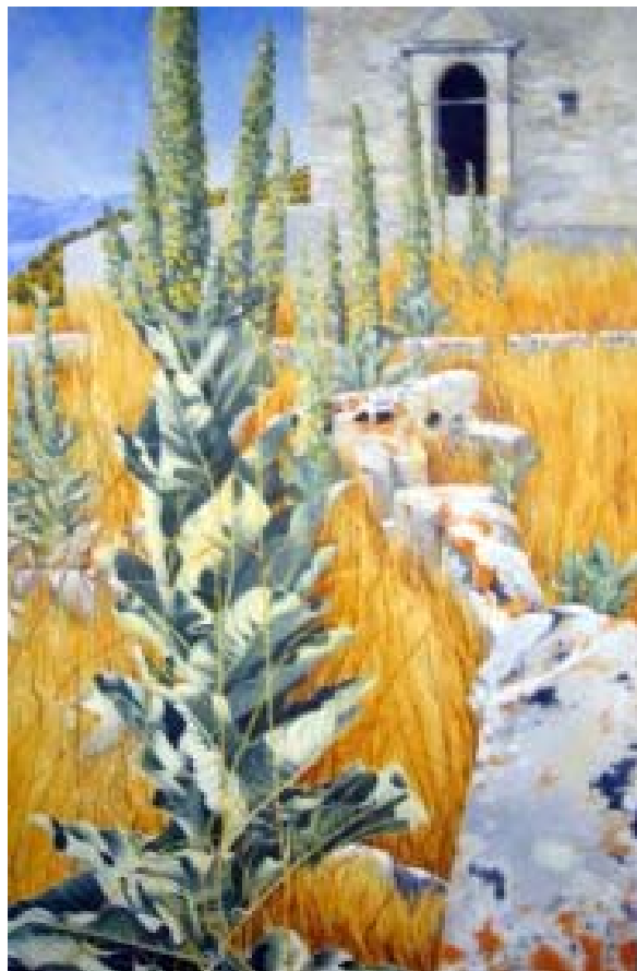
Summer in Polyrrinia – oil on canvas – 100 x 60m - €400