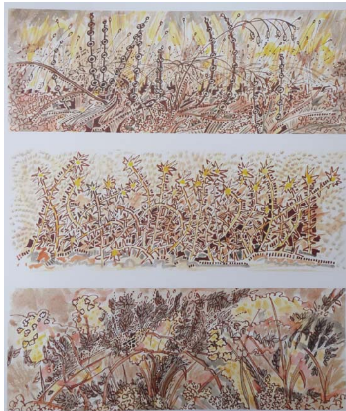
Summer Roadsides 48 x 56 cm (combined size - framed) Three-part print (1/50) of 3 watercolours. Framed €40 Unframed prints €10