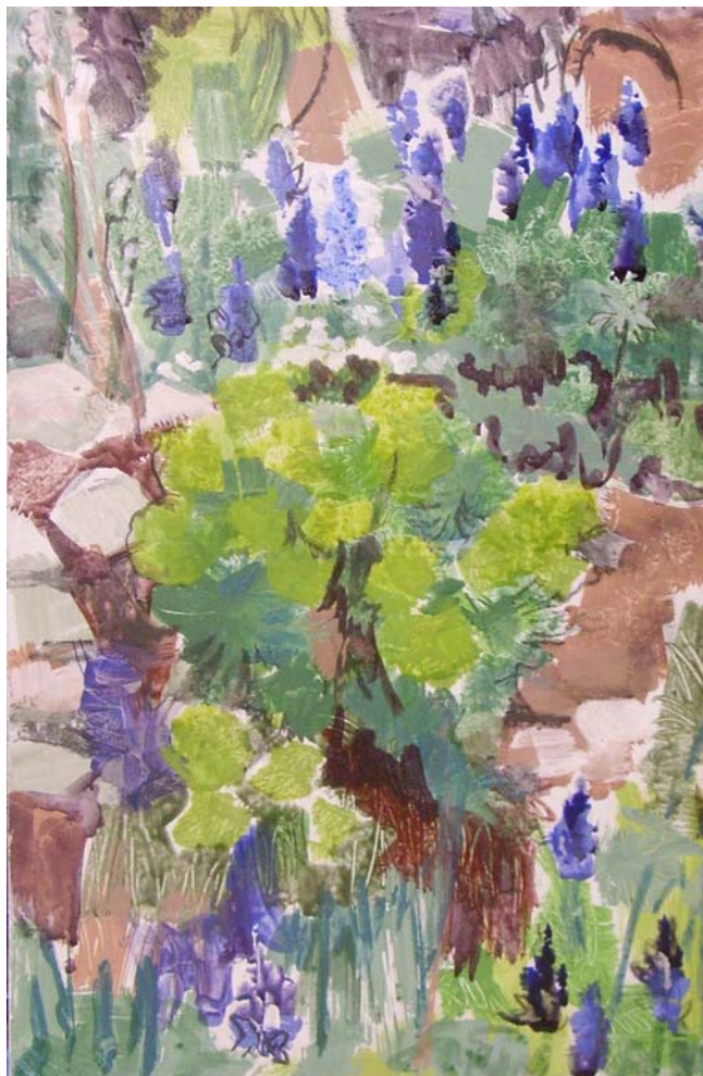
Lupins and Sun spurge