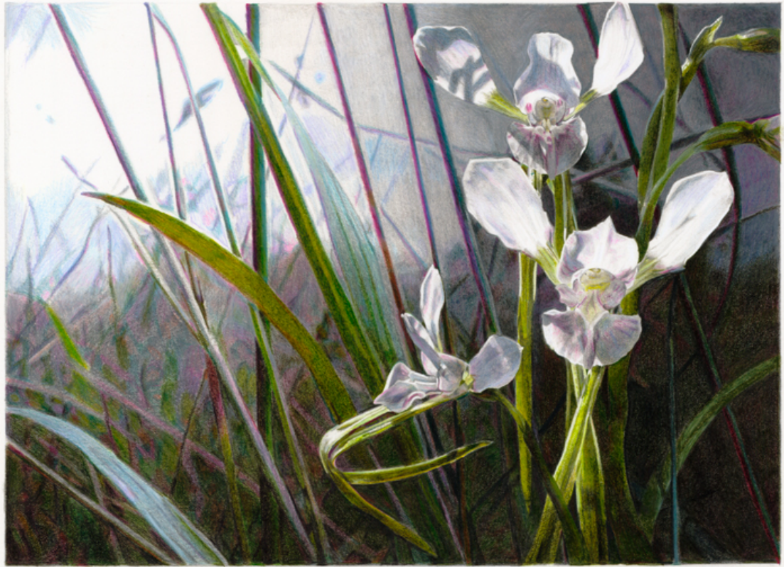
'Back from the Brink' Sunshine Diuris Diuris fragrantissima . Medium is watercolour pencils (aquarelle) but will only be exhibiting Limited Edition print, not the original.