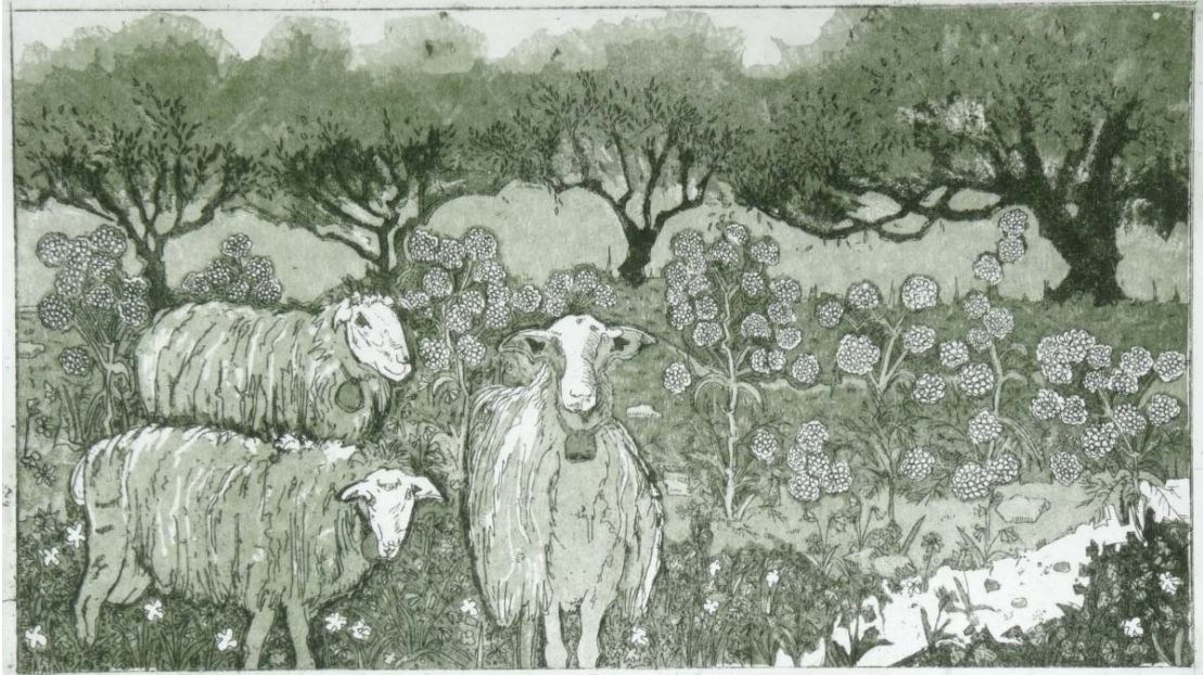
Akrotiri Spring 40 x 30 cm (framed) Framed €100 Etching (1/50) Unframed €80