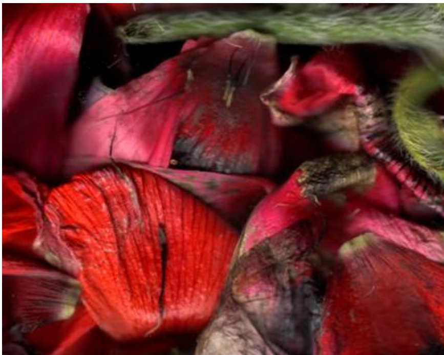
Poppy Petals – Scanned Image – 100 euros

www.janohighway.com information@janohighway.com www.artfarmproject.co.uk